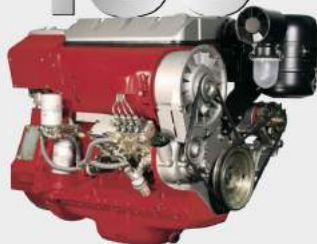
FL 912/913 32–128 kW | 43–173 hp D/TCD 914 43–130 kW | 58–175 hp