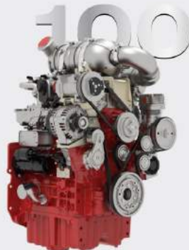
TCD 3.6 L4 69,5-100 kW | 93-134 hp