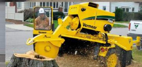
VERMEER, USA, stump grinder