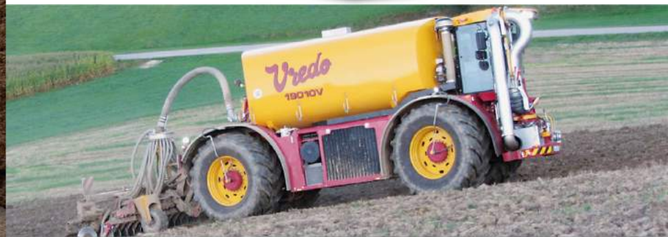
VREDO, Netherlands, self-propelled sprayer