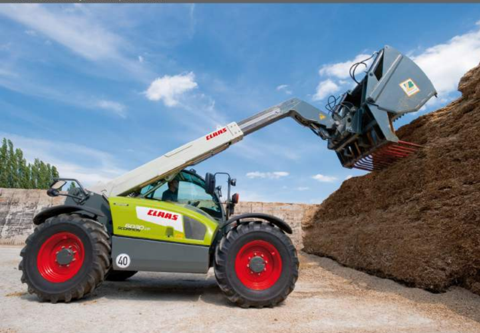
CLAAS, Germany, telescopic handler