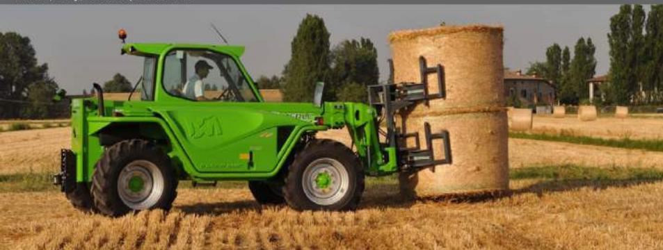
Merlo, Italy, telescopic handler