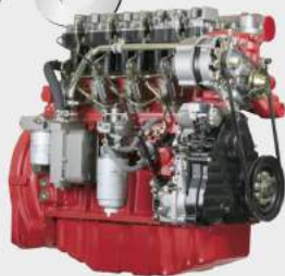
D/TD/TCD 2011 23–75 kW | 31–102 hp