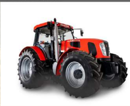
URSUS, Poland, tractor