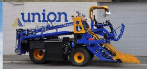
Union, Belgium, Flax harvesting equipment