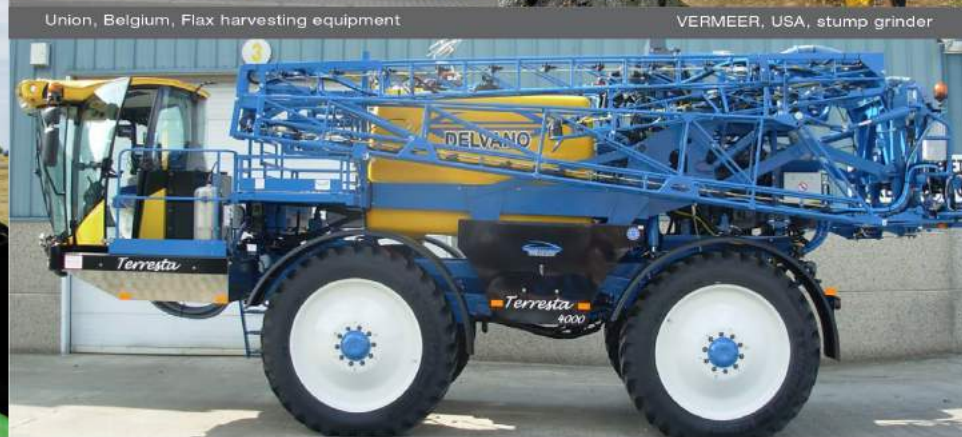
Delvano, Belgium, self-propelled sprayer