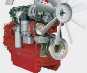
TCD 2012 67–176 kW | 91–282 hp