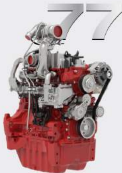
TCD 2.9 L4 45-77 kW | 60-103 hp

DEUTZ has a comprehensive product portfolio available for the emission stage EU Stage III B and IV/US EPA Tier 4. With the Diesel particulate filter, our engines already meet the requirements of the EU Stage V Emission Standard, which is scheduled to take effect in 2019.*