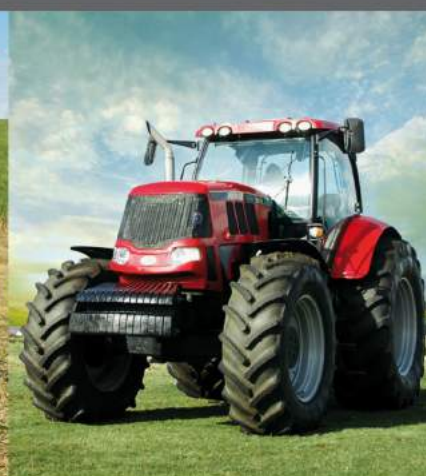
PRONAR, Poland, tractor