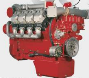
BFM 1015 187–440 kW | 251–590 hp TCD 2015 240–500 kW | 322–670 hp