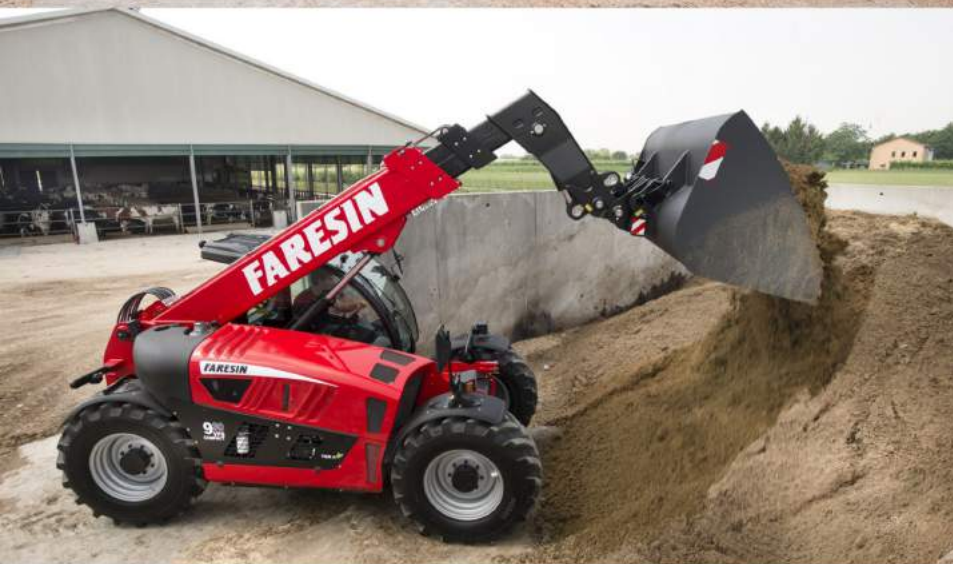
FARESIN, Italy, telescopic handler