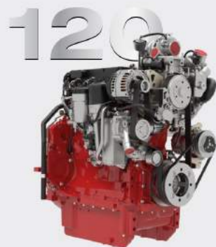
TCD 4.1 L4 84-120 kW | 113-160 hp