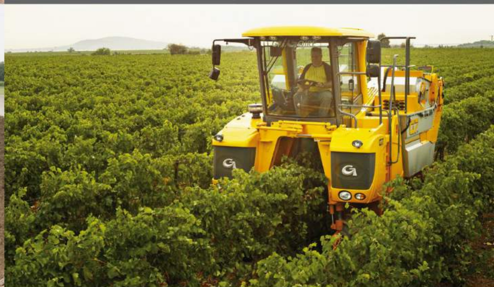
GREGOIRE, France, grape harvester