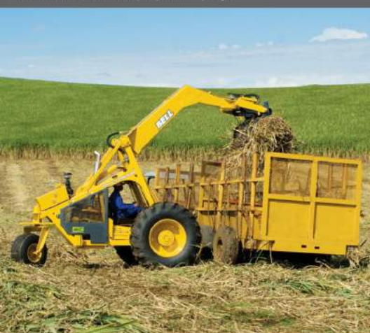
BELL, South Africa, cane loader