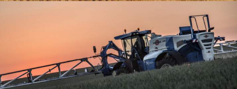
Matrot, France, self-propelled sprayer