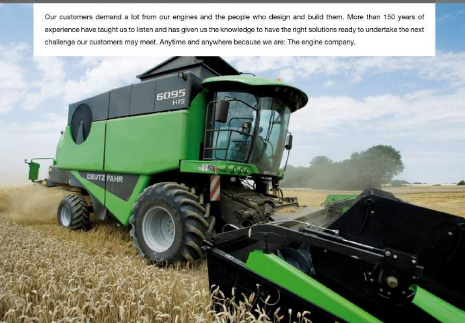
SAME DEUTZ-FAHR, Germany, combine harvester

Our customers demand a lot from our engines and the people who design and build them. More than 150 years of experience have taught us to listen and has given us the knowledge to have the right solutions ready to undertake the next challenge our customers may meet. Anytime and anywhere because we are: The engine company.