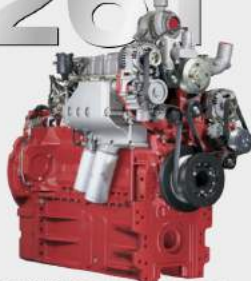
BFM 1013 90–186 kW | 121–249 hp TCD 2013 83–261 kW | 111–350 hp