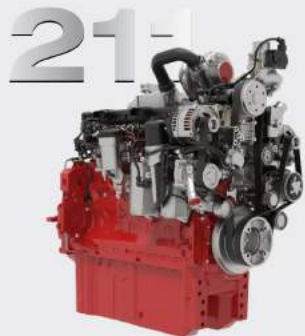
TCD/TTCD 6.1 L6 120-211 kW | 160-283 hp