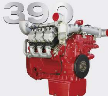
TCD 12.0 V6** 240-390 kW | 322-524 hp