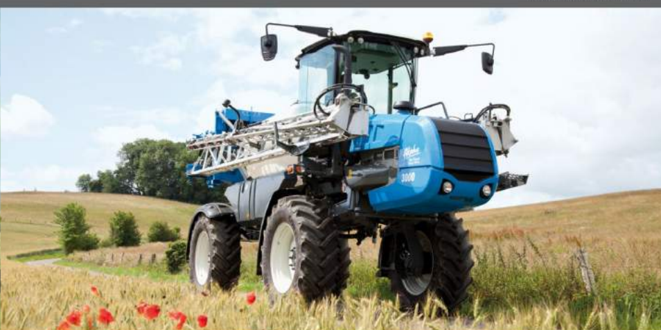
HARDI-EVRARD, France, self-propelled sprayer