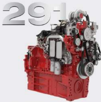
TCD/TTCD 7.8 L6 190-291 kW | 255-390 hp