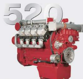
TCD 16.0 V8** 350-520 kW | 470-700 hp