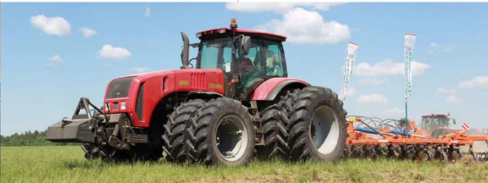
MTZ, Belarus, tractor